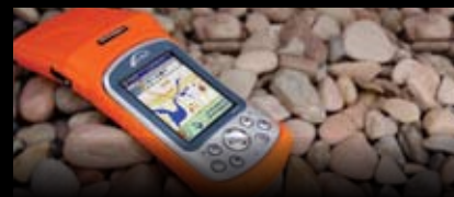
Archer plus Hemisphere GPS XF101 Receiver

Copyright 09/09 Juniper Systems, Inc. Specifications are subject to change without notice. Juniper Systems, the Juniper Systems logo, and Archer Field PC are registered trademarks of Juniper Systems, Inc. Bluetooth is a registered trademark of the Bluetooth SIG, Inc. All other trademarks are registered or recognized by their respective owners.