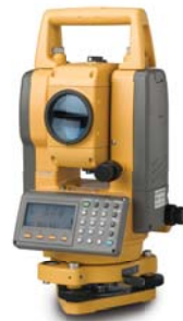
GTS-100N Series Construction Total Stations